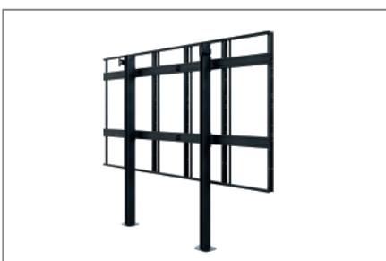
Low space requirement thanks to floor-wall mounting